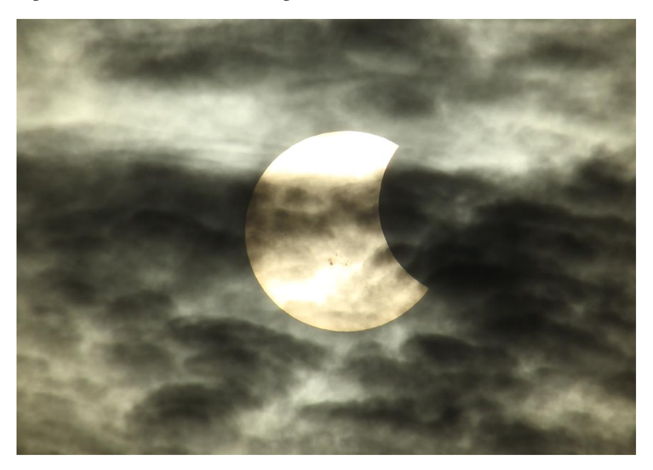
But why does this bear any importance? It happens all the time right?

Just to Clarify , the Bright circle in the photo below is the Sun, and the Dark object coming in front of the Sun from the right side, is the Moon.